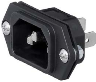
6100 with sealing to appliance