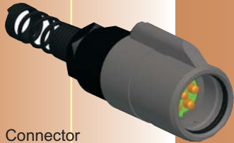
Connector shown with Plastic Over-Molding

Available in either Plastic Over-Molded or Plain Stainless Steel